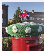
Blackbridge Lane Shops