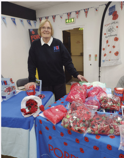
Poppies donated to Royal British Legion

Please keep sending us your photos and news for publication – Email to secretary@wsfw.co.uk and gandm.lancing@ntlworld.com