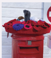
Co-Op North Parade

Horsham Normandy WI created over 500 poppies for the Royal British Legion to sell. We also made 9 Remembrance toppers including a larger one in the Carfax, near to the War Memorial. The White poppies remember everyone killed in war at any time or place.