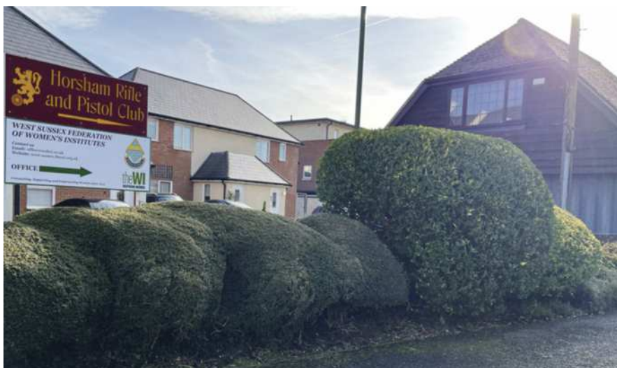
Our new sign and part of our building at Queen Street